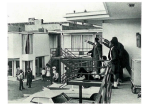
Illustration 2: Decoded emphasizes the creative process involved in the production of popular music. Illustration from Jay-Z, Decoded , exp. ed. (New York: Virgin Books/Spiegel and Grau/Random House, 2011), 98–9. Image used in accordance with Austrian copyright law pertaining to the use of images for critical commentary.

As hip hop is a globally practiced artistic form, transnational American studies offers further options for studying hip-hop life writing. Hip-hop artists' life writing predominately combines autobiographical narratives of personal growth through overcoming terrific obstacles and of emerging as a promoter of social justice with an explanation and defense of hip-hop culture and artistic production. In the US-American context, such success stories often take a detour through phases of poverty, racial discrimination, criminal activity, drug abuse, and the like. In addition to finding one's artistic self and defining one's positionality, 12 life writers find their way into a belief system in which to anchor their social activism.